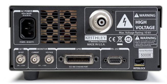
2290-10 rear panel showing the IEEE-488 interface connector, RS-232 interface connector, high voltage output connector, analog control/output connectors, and interlock connector.

The Series 2290's IEEE-488 interface allows the creation of an automated high voltage test system. Software drivers are supplied to simplify and accelerate test system development. This further enhances safety as the high voltage can be controlled from a remote location.