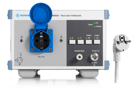
Germany, Austria, Finland, the Netherlands, Norway, Russia, Sweden, Korea; occasionally: Portugal, Spain