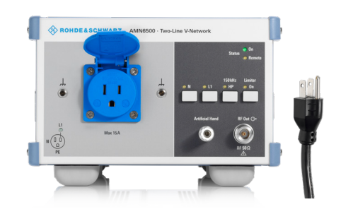
USA, Canada, Japan, Taiwan, Mexico, Central America