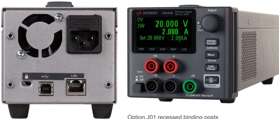
Option J01 recessed binding posts

Connect for computer control with standard LAN (LXI Core) and USB connectivity. Use the security slot to keep the supply on your bench.