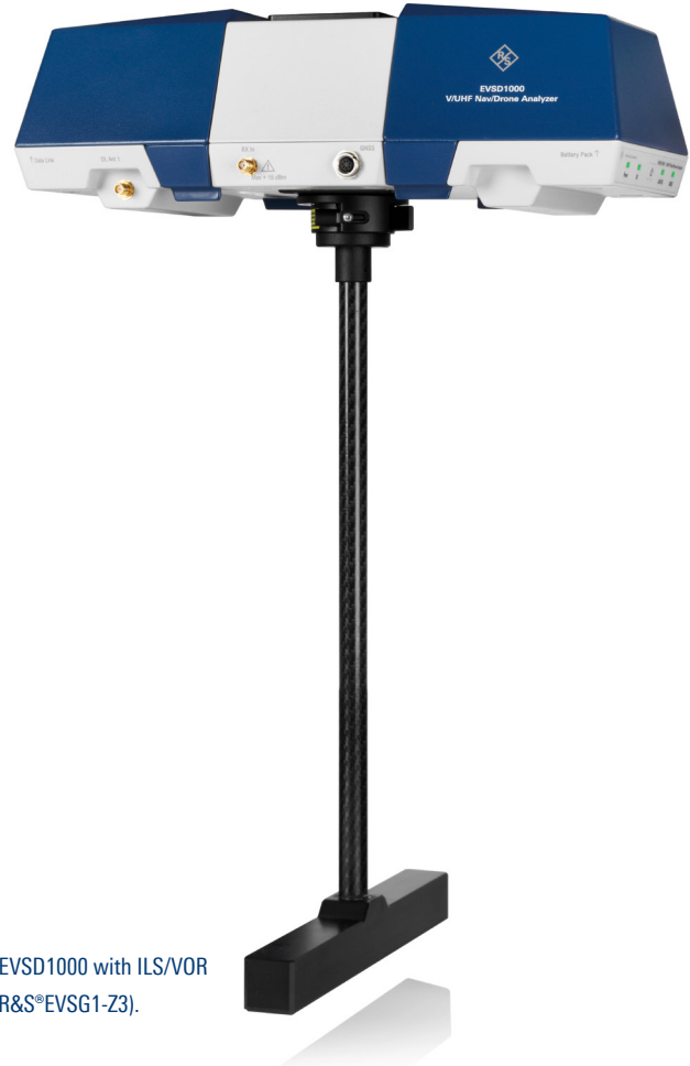
The R&S®EVSD1000 with ILS/VOR antenna (R&S®EVSG1-Z3).

R&S®EVSG1-Z11 verification test software lets users independently perform verifications. The software is run on an external PC and performs all the necessary and time-consuming measurements and automatically generates test reports.