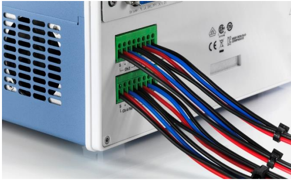
Connections for all channels – including sense – are also provided on the rear panel