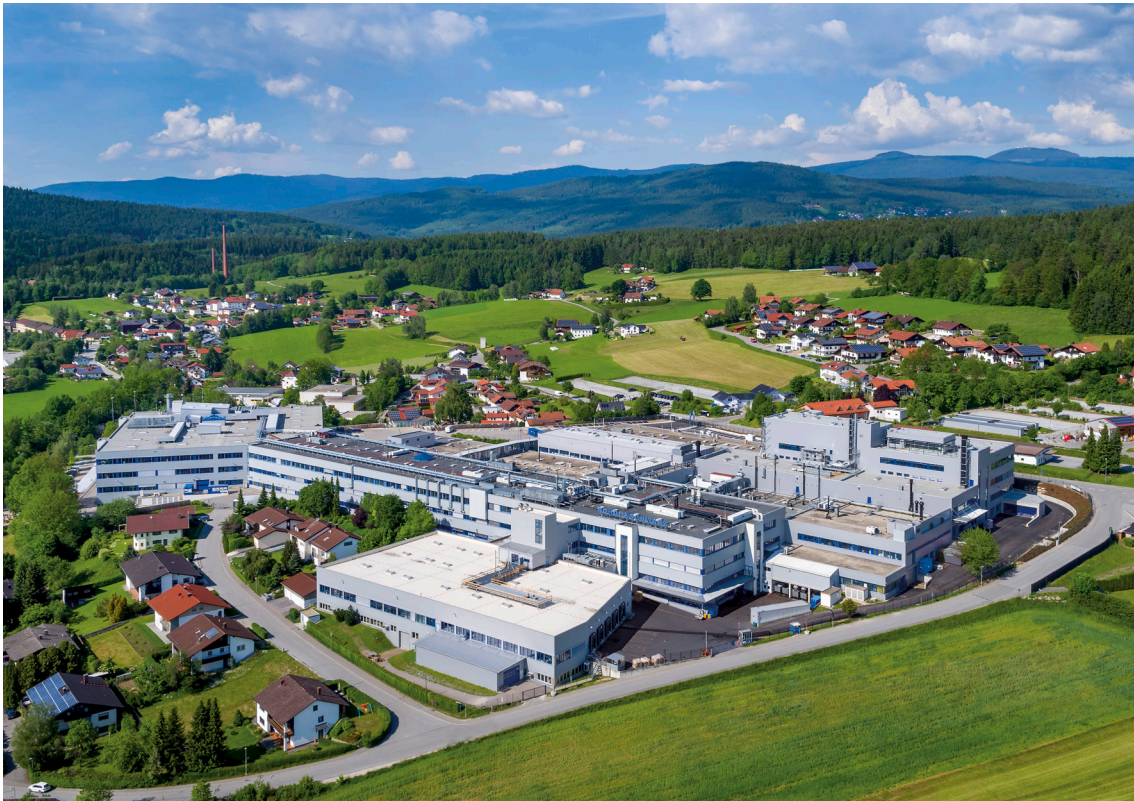
Rohde & Schwarz Teisnach plant

The R&S®SAM100 system amplifiers are series-produced in the most advanced plants in Europe. The Rohde&Schwarz plants offer superior manufacturing depth. From precision mechanical engineering and metalworking to printed board production and final assembly, all manufacturing steps are united under one roof. Automated final test rigs ensure that only products that comply with specifications leave the plant.