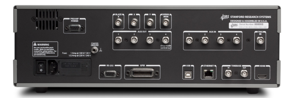
SR860 rear panel