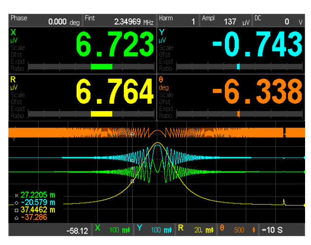
Large numeric readout with strip chart recording

The SR860's effective dynamic reserve is simply the ratio of these two settings. For instance with a 10\,\mathrm{nV} sensitivity setting and a 300\,\mathrm{mV} input range the effective dynamic reserve of the SR860 is 3\times10^7 , or nearly 150\,\mathrm{dB} .