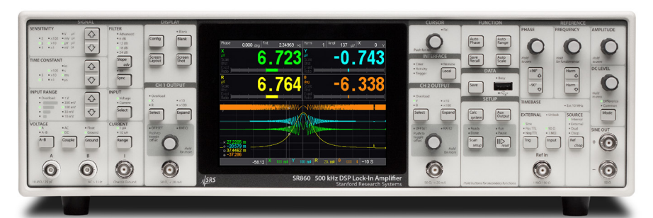
SR860 front panel