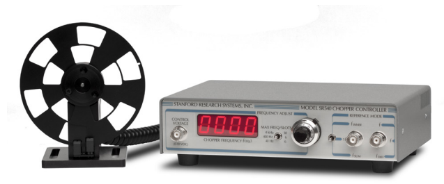
SR540 Optical Chopper

Synchronous filtering may also be selected at reference frequencies below 4 kHz. The synchronous filter notches out multiples of the reference frequency and is extremely useful in making low frequency measurement where multiples of the reference frequency would otherwise show up in the lock-in output. Unlike previous designs the synchronous filter in the SR860 can be selected with no loss of output resolution.