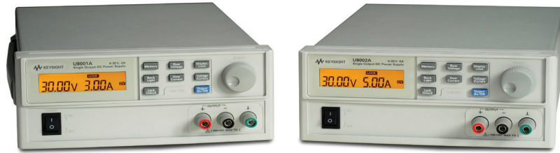
Figure 1. The U8001A 90 W and U8002A 150 W single output DC power supplies