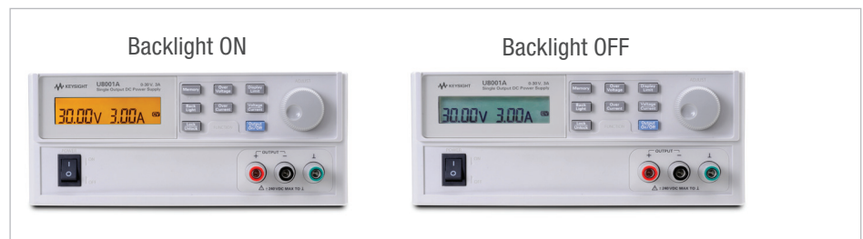
Figure 2. Backlight on/off options for LCD display