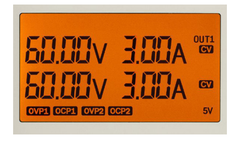
Figure 2. Backlight on/off feature with dual reading (voltage and current) on an LCD display